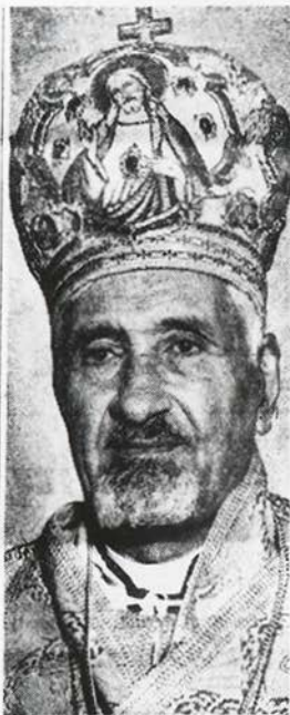
SYRIAN PATRIARCH — His Beatitude, Antonius Joseph (Aneel) I, patriarch in the United States and Canada of the Byzantine Universal Orthodox church, is in Portland to visit the local congregation and conduct solemn religious rites.

So the bishops in this country of the American Catholic, old Roman Catholic, Gregorian Orthodox and Melkite rite met in San Francisco and bestowed the apostolic rites of each church on each bishop. Now each bishop is authorized to conduct