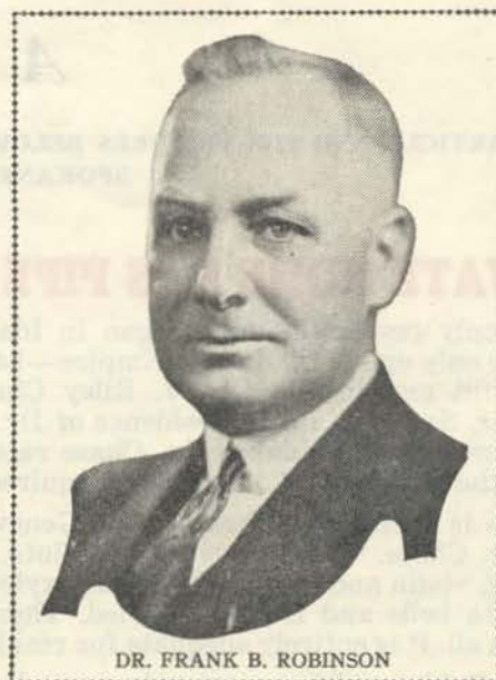
DR. FRANK B. ROBINSON

He Is Just an Ordinary Individual . . . Like You