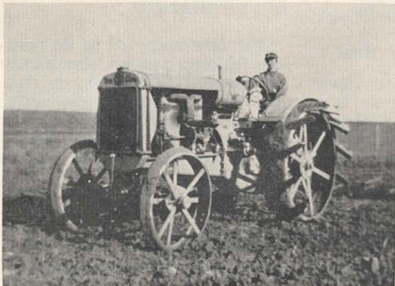
At left is a picture of the author as she appeared in her “plowing clothes.”