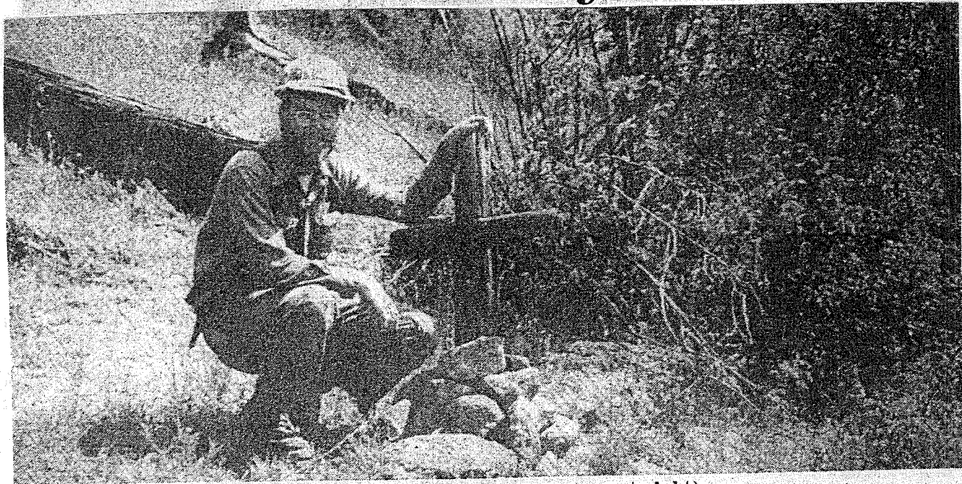
Archer gravesite (see story at right)