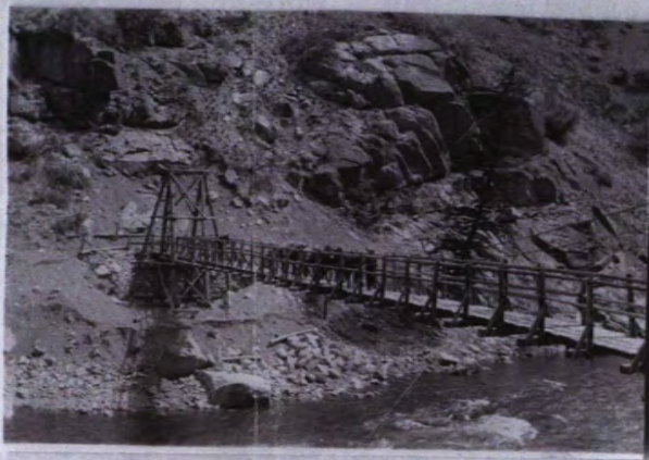
Pack horses crossing Middle Fork bridge at mouth of Big Cr.

↑ Across Big Cr from the mouth of Beaver Cr Burned