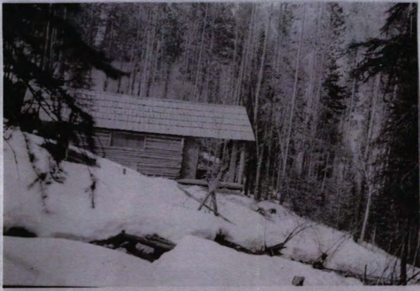
First spring in Beaver Cr Cabin 1935 Mr W.B. Boystun's cabin