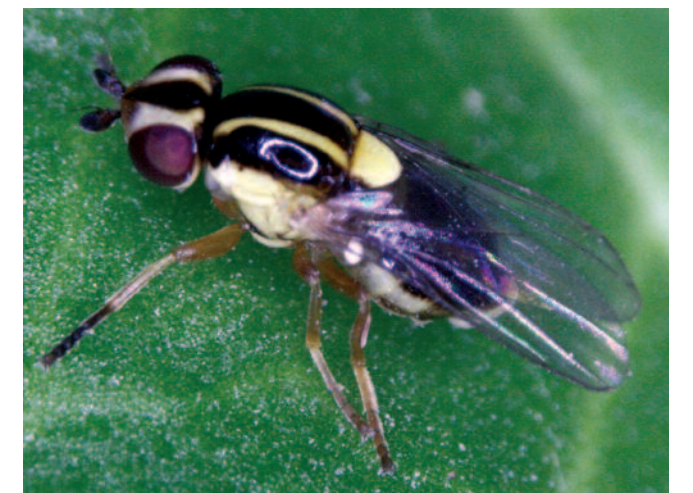
Figure 7. Adult Thaumatomyia glabra are about 5/64–1/8" (2–3 mm) long, and may be found alighting on foliage of sugar beets. The larval stage of this fly feeds on sugar beet root aphids and is capable of reducing aphid infestations below damaging levels.

A fungus ( Entomophthora aphidis ) also has been reported to drastically reduce root aphid populations in some years. Other arthropod natural enemies, including predatory ground beetles, likely contribute to control of root aphids to some extent. We do not yet know enough about T. glabra or other natural enemies to suggest practical ways of manipulating and enhancing