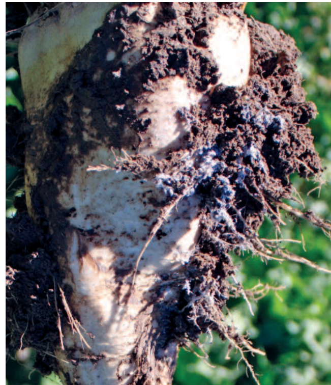
Figure 2. Characteristic “moldy” appearance of a sugar beet root results from white waxy secretions produced by a colony of sugar beet root aphids.

Sugar beet root aphids may be pinhead sized and up to 5/64-inch (2 mm) long. Aphids found on roots are pale whitish yellow and broadly oval to pear shaped (Figure 1). They secrete white, waxy strands, which give beets a distinctive “moldy” appearance (Figure 2) that makes infestations more noticeable. These waxy, “mold-like” secretions are not likely to be confused with symptoms associated with the most common sugar beet diseases.