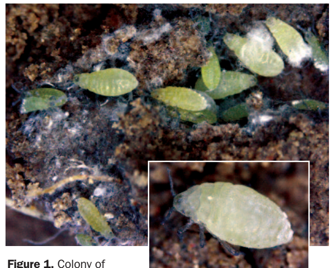
Figure 1. Colony of sugar beet root aphids. Individuals vary in size depending on developmental stage, but are typically pale whitish yellow and broadly oval to pear shaped. Inset. Mature wingless female, produces nymphs during the summer and may overwinter in the soil within beet fields.

This publication will help you design an integrated pest management (IPM) program for management of the sugar beet root aphid. The IPM approach combines cultural and biological controls with field scouting in order to reduce the need for chemical controls. Beet growers who use IPM can increase profits while encouraging natural enemies of pests and reducing potential harmful environmental effects associated with pesticides.