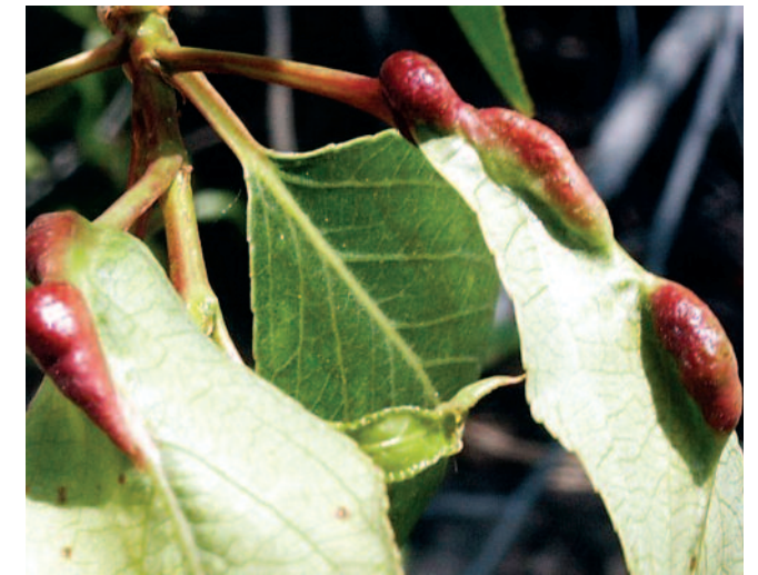
Figure 4. Feeding by a sugar beet root aphid nymph induces the formation of a pouch-shaped gall (or abnormal swelling) along the midrib of the leaf of certain Populus tree hosts. Galls may project from the upper or lower surface of the leaf, and multiple galls may be found on a single leaf.

Like all aphids, sugar beet root aphids have piercing/sucking mouthparts that are used to feed on plant fluids. Sugar beet root aphids feed on the roots of their host plants and do not feed on the foliage of sugar beets as do green peach aphids and black bean aphids. Root aphids cause damage to sugar beets by sucking sap from plant roots, which interferes with water and nutrient uptake by the plant.