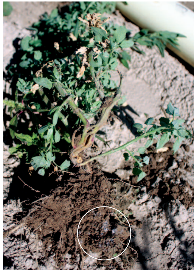
Figure 5. Sugar beet root aphid infestation on the weed common lambsquarters. Note the white aphid secretions on the roots (circled). Inspection of roots from common lambsquarters and other weed hosts of sugar beet root aphids is a convenient and non-destructive method of preliminary scouting for root aphids in and around beet fields.