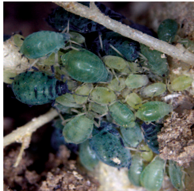
Figure 6. Two unidentified species of root aphids found on the weed common lambsquarters. These aphids can be distinguished tentatively from sugar beet root aphids by a darker green coloration and/or lack of obvious white, waxy secretions. These species are not known to attack sugar beets.

Important secondary hosts of sugar beet root aphids include the weeds common lambsquarters ( Chenopodium album ; Figure 5) and pigweed ( Amaranthus spp.). Management of these weeds is important to the overall management strategy for sugar beet root aphids (see IPM section). Several other plants—including other important weeds found in and around sugar beet fields—have been reported as secondary hosts of root aphids, but the host status of these plants has yet to be confirmed. These possible secondary hosts include green foxtail ( Setaria viridis ), prostrate knotweed ( Polygonum aviculare ), and dock ( Rumex spp.). Other root aphid species may be found on alternate weed hosts that are also used by sugar beet root aphids (Figure 6), but these other species are not known to attack sugar beets; these other root aphids may be tentatively distinguished from sugar beet root aphids by different body color and/or the lack of obvious waxy secretions.