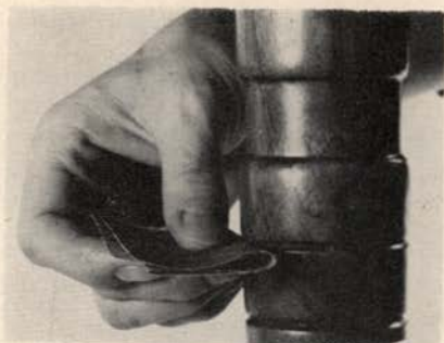
Hold sandpaper with grit side out to sand carved lines.

4. Sand the wood surface until it is satin smooth. Sanding determines the final beauty of the finish. Never use coarse sandpaper as it makes deep scratches that must be removed in the final sandings. Start with No. 3/0 or 4/0 garnet paper and finish with No. 6/0 or 7/0 garnet paper. Always sand with the grain of the wood and keep surface wiped free of sawdust. You may use an electric sander of the vibrating type for the first sanding on