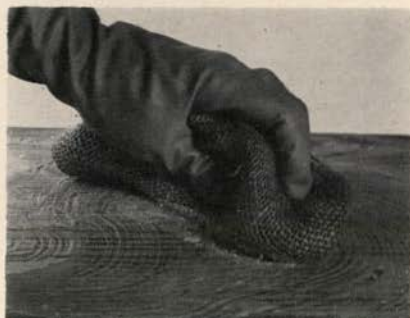
Rub with clean burlap in a circular motion to work filler into wood grain.

the paste filler you use. If the wood has been stained, add stain to the filler. The filler may be the same tone as the wood or you can get a nice effect by making the filler slightly darker than the wood to accent its grain. Filler the consistency of thick cream is best. If it needs thinning, use naphtha or mineral oil.