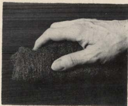
Rub lightly with 4/0 steel wool or 6/0 garnet paper between coats of finish.

Be sure to read instructions for the penetrating seal you use. Methods differ. Some manufacturers recommend wiping off excess seal after a "setting up" period. Others do not. Before applying the seal, wipe wood surface and paint brush with tack rag to remove all dust and dirt particles. Allow the seal to dry at least 48 hours. Test with your thumb nail. The finish will be hard, not soft or tacky when dry. Rub lightly with 6/0 garnet paper or 4/0 steel wool