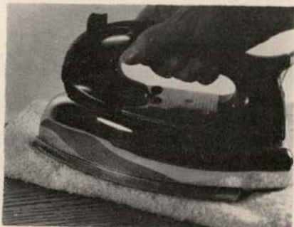
Raise indentations with steam

1. Raise indentations with steam. Place a damp, heavy cloth over the dent. Touch heated iron to the cloth on the spot over the dent. The steam will swell the wood fibers. Repeat until the former indentation is level with the surrounding surface.