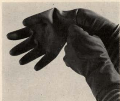
Wear rubber gloves