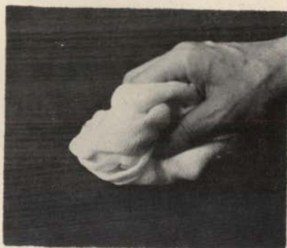
Rub wood surface with pumice and oil for hand-rubbed look.

Rubbing the wood with pumice and either linseed oil or mineral oil gives it the soft glow or professional, hand-rubbed look so desirable on good furniture. Dip a pad of cheese cloth in enough oil to moisten the pumice, then in the pumice powder, and rub the wood surface gently. Rub long but gently. Allow time each day for several days to do some rubbing.