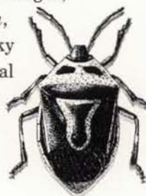
Fig. 4. Twospotted stink bug.

The twospotted stink bug , Perillus bioculatus , feeds almost exclusively on Colorado potato beetles. It attacks larvae as well as eggs and adults and can be purchased for field releases. An important parasite is the tachinid fly , Myiopharus doryphorae , which attacks second through fourth stage larvae. A soil-borne fungus, Beauveria bassiana , forms a dense chalky mold that kills pupal and adult Colorado potato beetle and other insects in the soil.