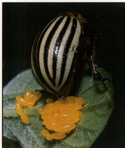
Fig. 1a. Above, adult beetles have 10 black stripes on their yellowish-brown wing covers.

Colorado potato beetle, Leptinotarsa decemlineata, is native to the western plains states. It was first detected in Idaho at Lewis and Nez Perce counties during 1905. Eradication programs kept its spread in check until the 1930s when extensive outbreaks permanently established populations in southern Idaho. Colorado potato beetle now occurs statewide.