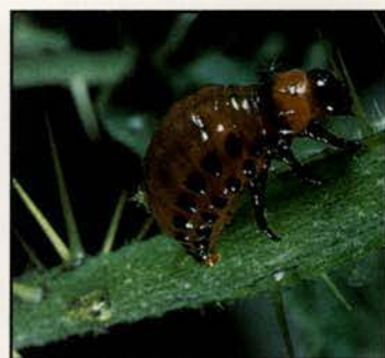
Fig. 1b. Above, humpbacked, reddish larvae have two rows of black spots along each side of their body.

Adults overwinter 4 to 10 inches deep in the soil of the previous year's potato fields. Beetles emerge just before potato plants begin to grow. Adults cannot fly until a week after emergence, so they first colonize