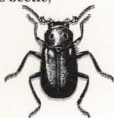
Fig. 3. Two-spotted collops beetle.

Collops bipunctatus , is an effective egg predator.