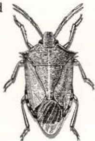
Fig. 6. Spined soldier bug.

One promising species is the spined soldier bug , a predatory stinkbug that feeds on eggs, larvae, and adult Colorado potato beetles. Spined soldier bug also attacks loopers, armyworms , and other leaf-feeding caterpillars. It is native to the eastern United States and should be able to survive Idaho winters. A synthetic sex attractant (Rescue! Soldier Bug Attractor, Sterling International, Inc., P.O. Box 220, Liberty Lake, Washington, 99019) can be used to keep soldier bugs at release sites. The attractor consists of a 6-inch tall plastic cone, and is intended primarily for home gardens and backyard orchards.