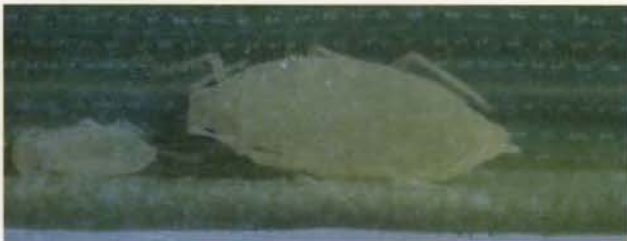
Figure 2. Russian wheat aphid. The short projection above the tail (far right on photo) gives the aphid a double-tailed appearance characteristic of this species.