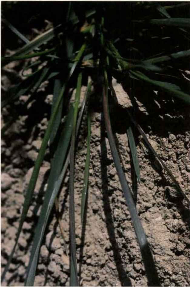
Figure 1. Russian wheat aphid damage on winter wheat in the fall. Note purple streaking and rolled leaves.