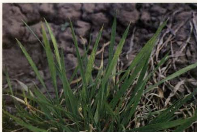
Figure 6. Early symptoms of wheat streak mosaic appear as hairline streaks on the newest leaves. Streaks broaden and become bright yellow as leaves mature, as shown here.