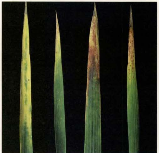
Figure 4. Symptoms of barley yellow dwarf (BYD) in wheat include reddish yellow leaf tips; stiff pointy leaves; and stunting. BYD is caused by a complex of viruses transmitted by aphids to winter wheat and other plants.