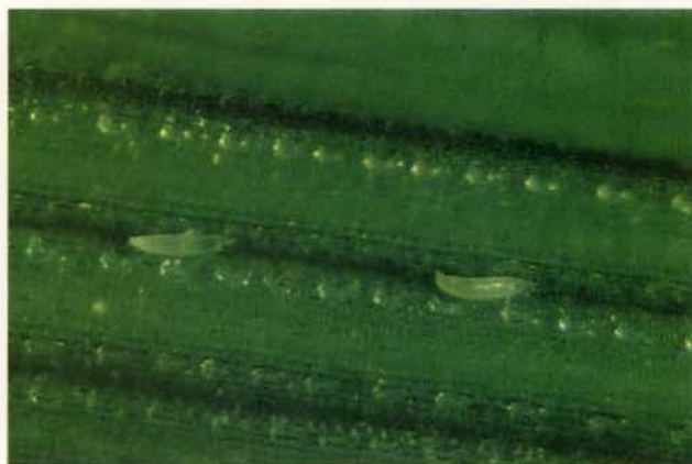
Figure 5. Microscopic wheat curl mites (on dark green stripe) on wheat leaf. Wheat curl mites can transmit wheat streak mosaic virus (WSMV), a very serious disease of wheat.

Most crop damage occurs when aphid populations increase and the aphids spread BYDV within a field (secondary spread). At-planting and foliar-applied insecticides have been shown to be effective in retarding secondary spread. In general, at-planting systemic insecticides are not recommended unless crops must be planted before flights of aphid vectors have subsided to safe levels.