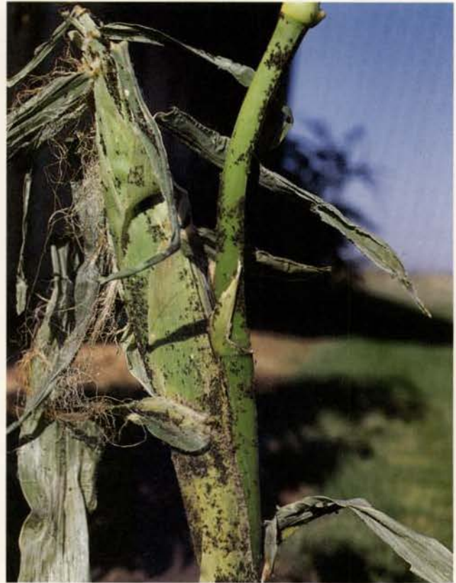
Figure 3. Bird cherry oat aphids on corn. Bird cherry oat aphid populations can be very high on corn. As corn matures, aphids leave the plants and can form colonies on winter wheat, sometimes carrying barley yellow dwarf virus (BYDV) with them.