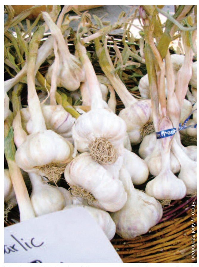
Planting garlic bulbs bought in grocery stores in home gardens is illegal in Idaho, an effort to protect commercial crops from disease. Instead, plant only true seeds or stock grown in one of the 21 Idaho/Oregon counties where crops are inspected and certified to be free of white rot.

White rot ( Sclerotium cepivorum ) is a fungal disease of onions that occurs throughout the world. It is through infected sets, transplants, cloves, bulbs or bulblets that the white rot fungus can be brought into the state.