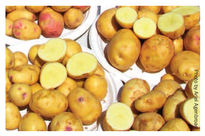
In Idaho, all potato tubers sold for planting on farms and in gardens must be inspected and certified to be free of disease.

Each seed is genetically unique and, when planted, could develop into a different potato variety. Consequently, growers have long relied on planting pieces of potato tubers as "seed" to regenerate and reproduce consistent, identical copies (clones) of the parent plants. However, several devastating potato diseases such as late blight, Fusarium dry rot, soft rot, bacterial ring rot and others can be carried in the "seed" tubers.