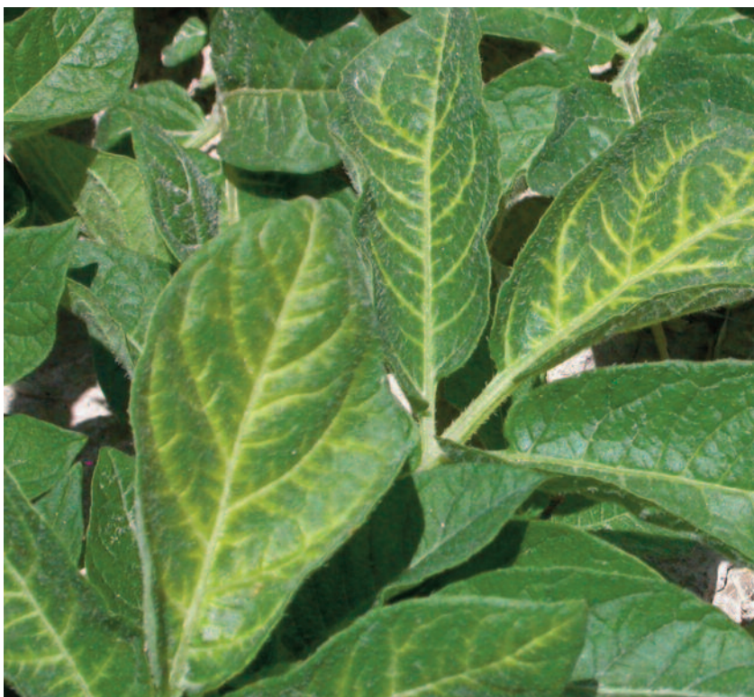
Figure 3. Yellowing/chlorosis of the leaf veins caused by a preemergence metribuzin application to a susceptible potato variety. In susceptible varieties, necrosis/burning, stunting, or plant death also may occur and tuber yields and quality may be reduced. These symptoms may also appear on metribuzin-tolerant varieties due to slowed metabolism caused by stress/environmental conditions including cloudy weather just prior to or after postemergence application. The plants usually recover within a week or so and no yield loss occurs.