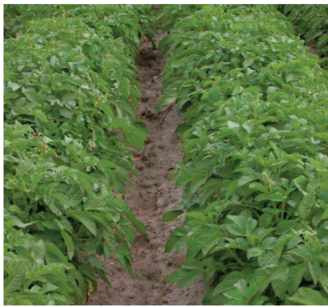
Figure 1. Nontreated weedy control on the left compared with control by preemergence application of metribuzin at 0.67 lb/A + Chateau® at 1.5 oz/A on the right in weed control trials. Trials were conducted with Russet Burbank at the University of Idaho Aberdeen Research and Extension Center. Weeds present in the plots and controlled by the mixture included hairy nightshade, common lambsquarters, redroot pigweed, and green foxtail.