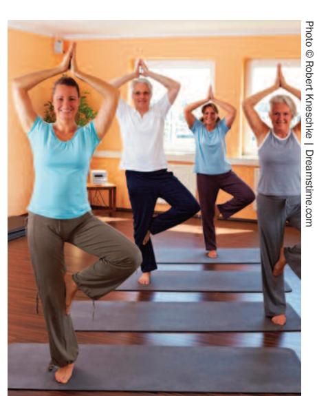
Yoga is one form of coordination-balance exercise.