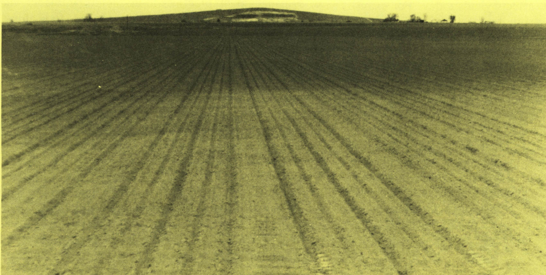
Fig. 1. White soil resulting from furrow erosion and tillage mixing on the upper end (foreground) and topsoil on the lower portion of a typical field.

A recent survey of the Magic Valley of southcentral, Idaho indicated that about 75 percent of the fields had white soils on the upper portions. In a separate study of 14 cooperating farmers' fields, the average portion of