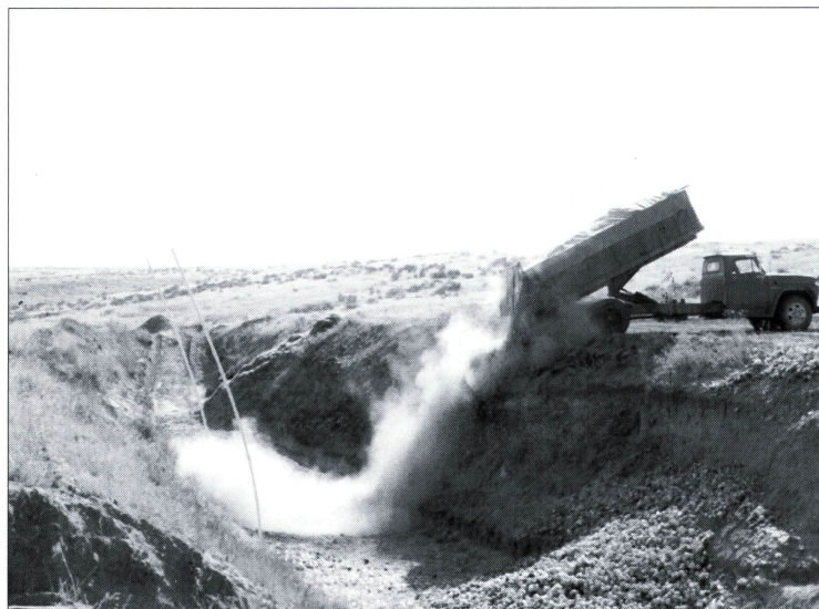
Figure 3. Filling of the pit should begin at one end in order to facilitate coverage with soil during loading.

1 Disposal Site Selection - Landfills or burial pits used for cull onion disposal should be established in areas where disposal operations will not pose an odor nuisance to people living adjacent to the site. The site should be in an area where the water table is sufficiently deep (depths of 100 feet or deeper) to avoid groundwater seepage into the pit during operation and to minimize ammonium-N, nitrate-N, odors, or any undesirable substance associated with rotting onions from entering the groundwater supply. Idaho law requires that permission for burial pit operation be obtained from county officials. Additionally, local district health officials, the Idaho Division of Environmental Quality, and the Idaho Department of Agriculture should be consulted before developing a burial pit disposal site to avoid violation of applicable environmental and agricultural regulations.