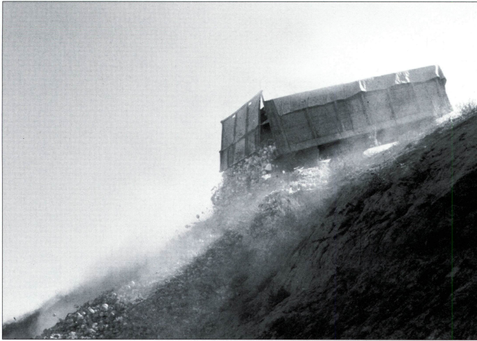
Figure 1. The most common method for cull onions is to bury them in unlined, covered pits or landfills.

safe when using proper management practices (Hutchings et al., 1998). In this bulletin, we will summarize the experimental findings of this study and recommend environmentally sound management practices for disposal of cull onions in burial pits or landfills.