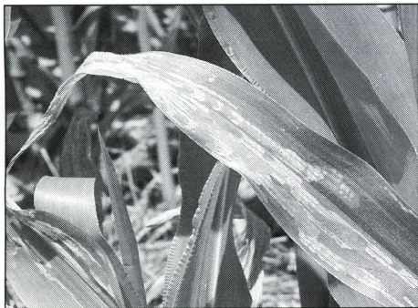
Fig. 1a and b. Blotch mines produced by Agromyza parvicornis on leaves of corn plants