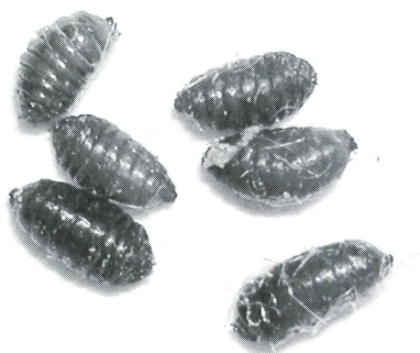
Fig. 4. Corn blotch leafminer ( Agromyza parvicornis ) pupae