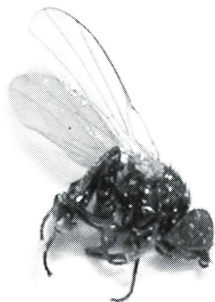
Fig. 2. Corn blotch leafminer ( Agromyza parvicornis ) adult

A new corn pest, the corn blotch leafminer ( Agromyza parvicornis ), was discovered in July 2002 in a northeastern Idaho field near Rigby. According to all available information, this was the pest's first occurrence in Idaho, although it has been reported previously in Southeastern and Midwestern states and, in 1995, in Nebraska. The current scientific literature indicates that corn is its only known host plant.