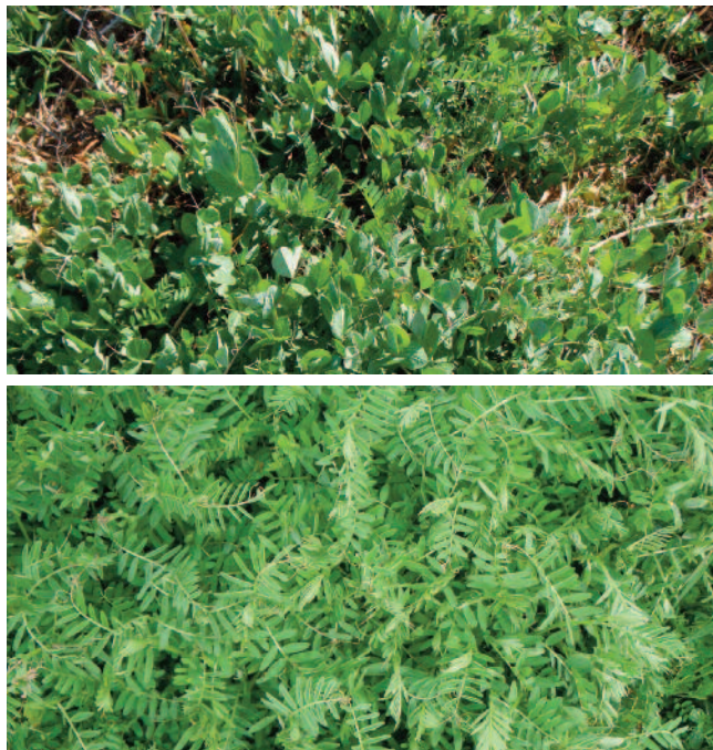
Figure 3. Austrian peas (top) and hairy vetch (bottom) are sometimes grown as winter cover crops in southern Idaho. Photos taken in mid-spring, Nampa, Idaho.