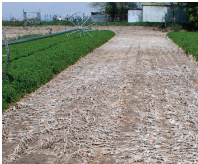
Figure 4. Mustard residue left over in early spring from winterkill, Aberdeen, Idaho. Note the lack of weeds growing on this plot.