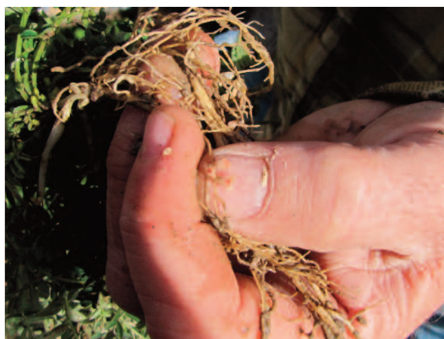
Figure 2. Pink coloring in dissected legume root nodules of hairy vetch at Aberdeen, Idaho, indicates an active population of N-fixing rhizobia bacteria.

Many organic growers in the Magic Valley have had success maintaining at least 50% of their cropland area in alfalfa for a minimum of 3 years in order to build nitrogen reserves as well as improve soil structure and organic matter content. Growers who are transitioning a field from conventional to organic production are required to follow organic regulations for 3 years before the field can be