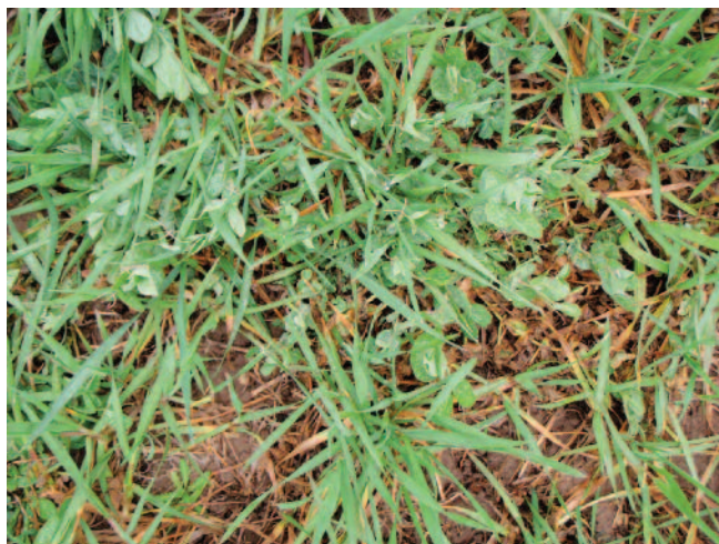
Figure 5. Austrian pea and winter wheat blend in early spring, Shoshone, Idaho.

When relying on cover crops as an N source, growers often search for simple tools to help them to predict how much N they can expect to be released from the plowed-under plant material. One useful tool currently available to growers is the OSU Organic Fertilizer and Cover Crop Calculator available at smallfarms.oregonstate.edu/calculator/ . The calculator was created to allow Oregon growers to quickly and easily predict N availability from green manure crops based on tissue N content, total biomass, and dry matter content. While a similar cover crop calculator is currently being developed for Idaho conditions, the Oregon calculator may be used to provide a rough estimate of how much N will be released from a cover crop that has been plowed under. The Idaho cover crop calculator will be completed and available online starting in September 2013.