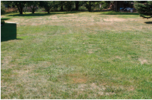
Figure 3. Backyard lawn with billbug damage.