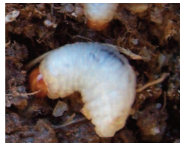
Figure 2. Billbug larva.