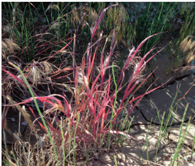
Figure 3. Weedy grass species can act as alternate hosts for the aphid vectors and barley yellow dwarf virus.

Often, field edges and the edges along center pivot tire tracks are most severely affected by the disease (figure 1). BYD incidence declines along a gradient toward the center of the field. Additional symptoms may include notching of the leaf margins, twisting, leaf tip scorch, and abnormal development of emerging leaves. Infected weedy grasses in nearby ditch banks, which act as alternate hosts for the virus and aphid vectors, may also exhibit yellowing or a very characteristic reddening of leaves (figure 3). Symptom development in the host plant is greatest at temperatures below 75°F (59°–65°F) and at high light intensity.